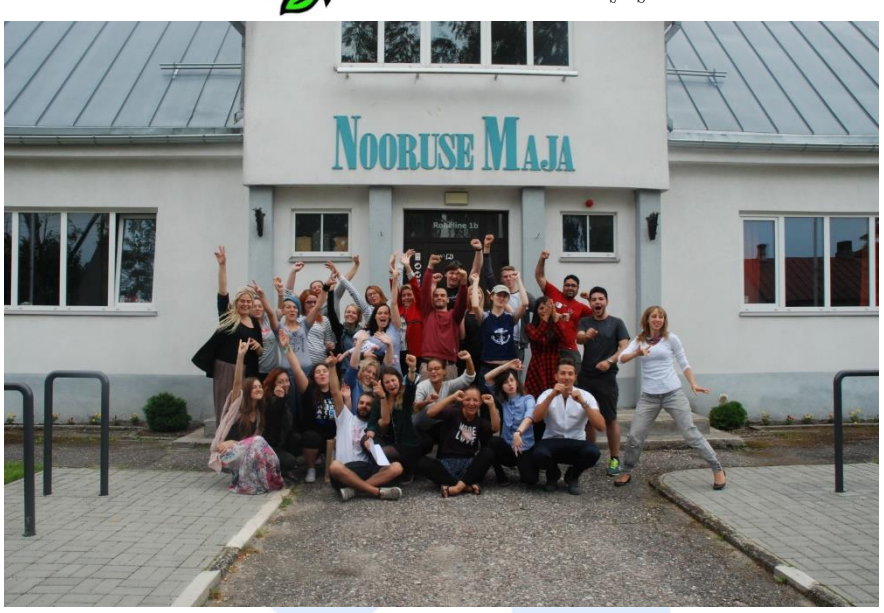
A training for youth workers at Nooruse Maja.

Estonians are thought to be a singing nation. People from Rääma are also Estonians,