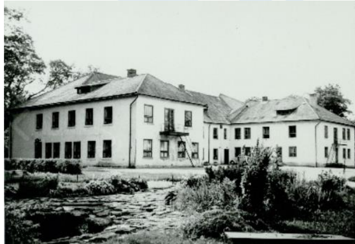
The reconstructed main building of Rääma Manor in 1977.

Rääma manor house was a white twostorey building with an older wooden part on one side. The house had two entrances: one in the front and one in the