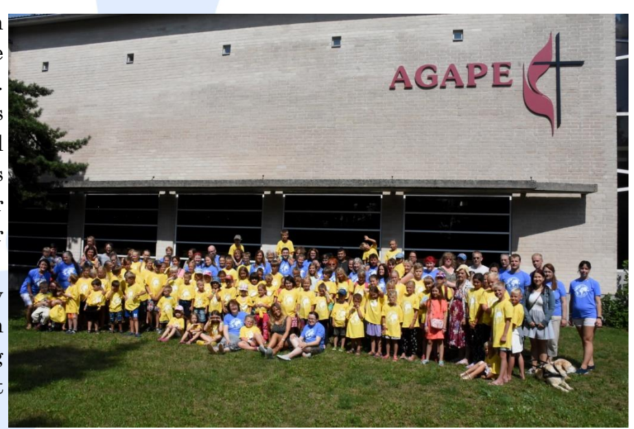
Agape Children's Summer School.

organisations dates back to 1921 when the Methodist