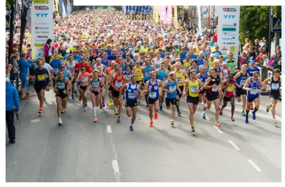
The run of the two bridges on Jaanson's track.

Part of the track goes through Niidu landscape reserve area, so there are more trees and greenery here compared to the track across the river.