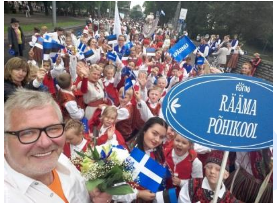
Representatives of Rääma School at the parade of the song and dance festival in 2017.

In 1922-23 the shool had 165 pupils, a fifth grade was added.