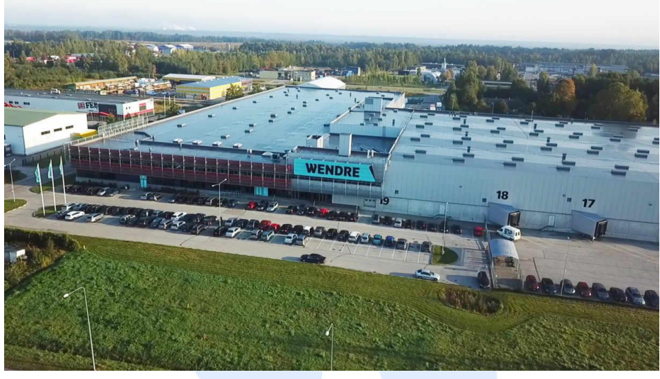
Production faculty of Wendre at Lina Street 31.

the local vocational school and labour office since 2014.