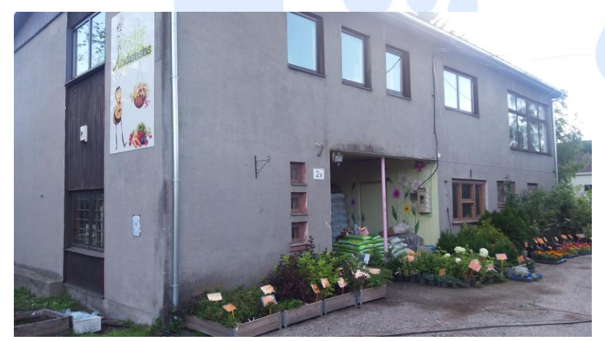
The building owned by Pärnu Aianduse ja Mesinduse Selts.

A second floor was added to the juice collection point. The money from this